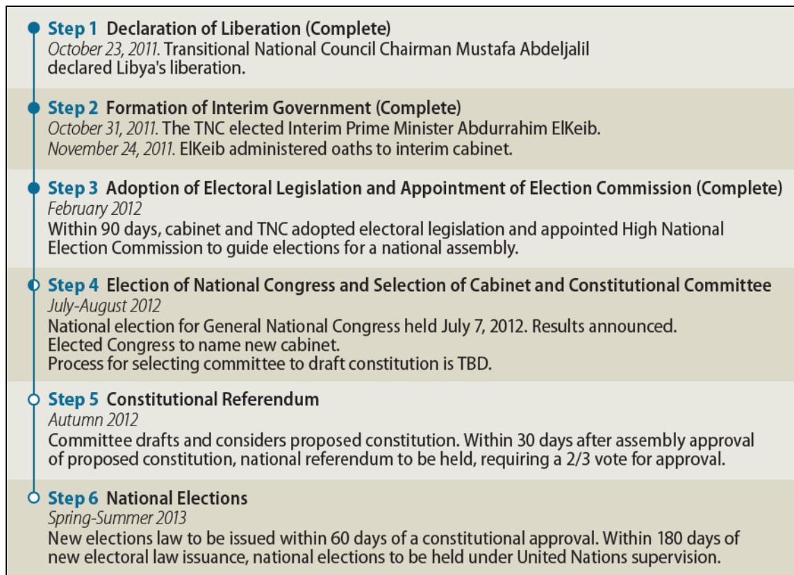
Figure 3. Libya's Proposed Transition Timeline